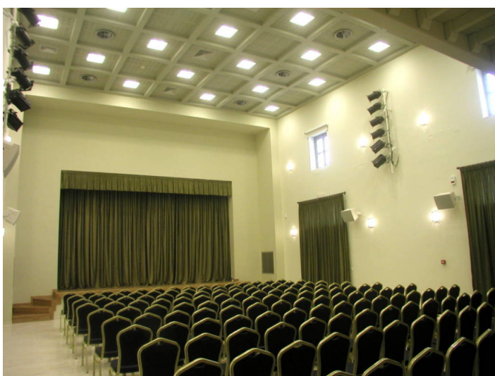
Conference Hall, House of Culture, Rethymno.